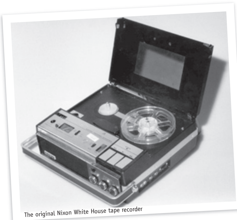
The original Nixon White House tape recorder